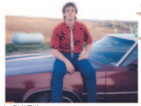
by Phil Ellis, Gateway 2000 On-line Services Representative (ultra-cool high school senior)

Upgrade fever is here! With the price of RAM plummeting, more and more PC users are trying to increase the capabilities of their current systems before taking the big plunge into a new Gateway 2000 PC. And why not? It's inexpensive and effective. The following are a few of the most frequently asked questions about upgrading your system's memory. Check them out. They help make your decision to upgrade a lot easier.